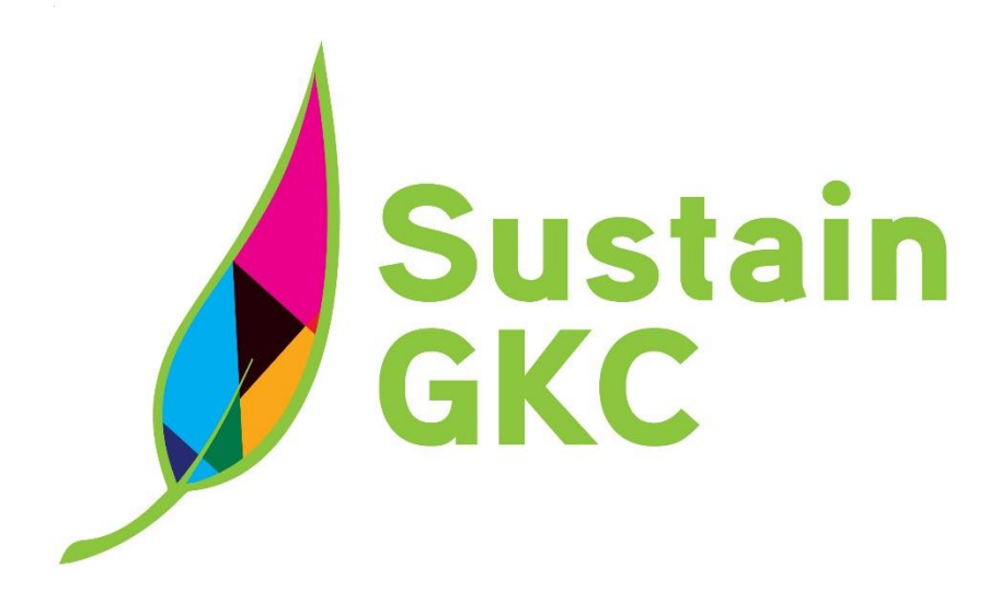
Climate Change Action Plan 2023